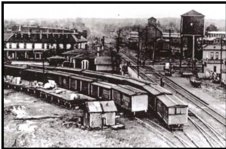
(Deshler railroad hub.)

Most of Ohio's early rails connected towns within the state or only went a short distance to neighboring states. The first railroad completed in Ohio connected Toledo with Adrian, Michigan. This changed in the mid-1850s when the