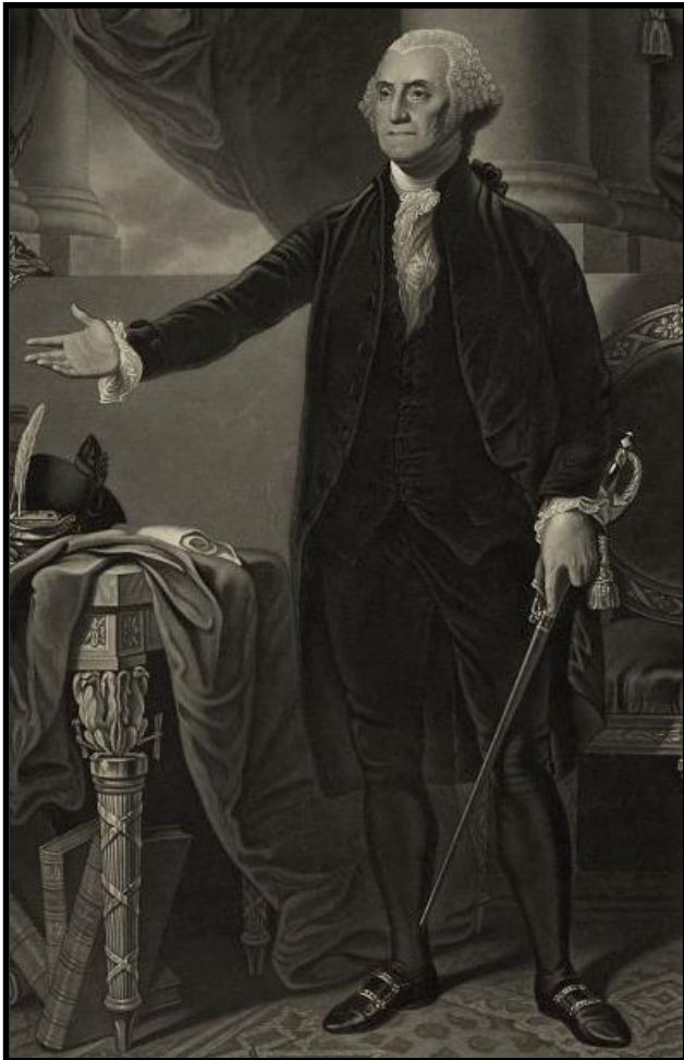
(Portrait of George Washington.)

British tried to impose taxes on sugar, tea, and printed documents . This caused the colonies to come together to fight against British rule and become their own nation. At the second Continental Congress, the colonial government, led by